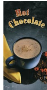
Model FMD-1 available with optional Hot Chocolate Display