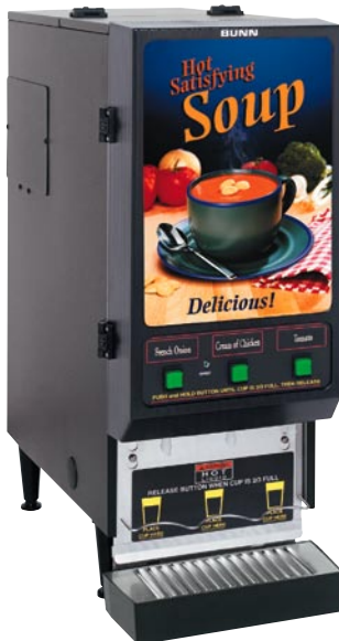
FMDS-3 front display panel

Dimensions: 30"H x 11.3"W x 23.3"D (76.2 cm H x 28.7 cm W x 59.2 cm D)