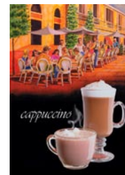
Model FMD-3 available with optional Cafe Display

Dimensions: 30"H x 11.3"W x 23.3"D (76.2 cm H x 28.7 cm W x 59.2 cm D)